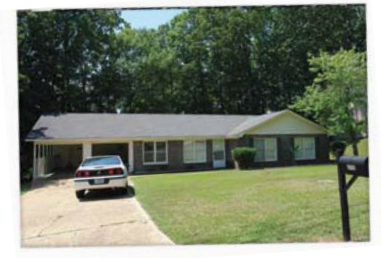
Typical home in the community in Alabama

community settings is valuable part of the effort to ensure appropriate services and supports, health and safety, and overall welfare of the individuals residing in community settings. Currently ADAP utilizes students with special training and individuals with disabilities to assist with monitoring. However, additional personnel and resources are needed to continue this effort.